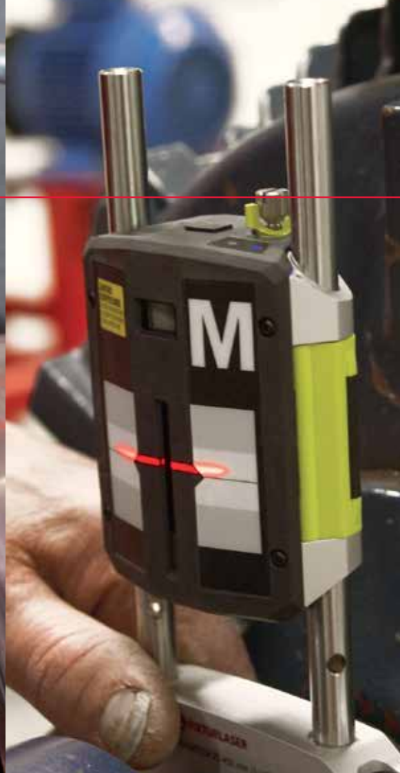
FIXTURLASER NXA Pro